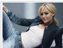
20 celebrities we didn't know were gay before they came out.