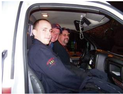
Zoom