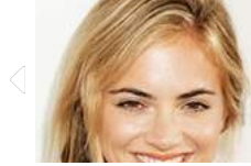
NCIS: Emily Wickersham Promoted to Series Regular