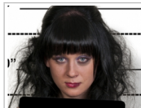
Rochester arrest records. Who do you know? You may be surprised! Search anonnal